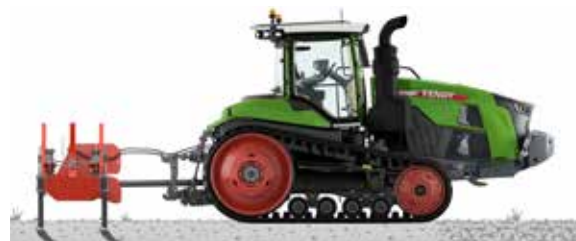
Figure 1: A tractor goes to work without proper tractor and implement weight distribution. This results in insufficient front weight on the tractor, and as a result increases slip.

When equipped with Smart Ride Plus suspension, the 1100 Vario MT features a load-leveling suspension system. With the push of a button in the cab, Smart Ride Plus uses hydraulic pressure in the track suspension elements to raise or lower the front of the machine. This results in better weight distribution for better traction, ride, and overall performance.