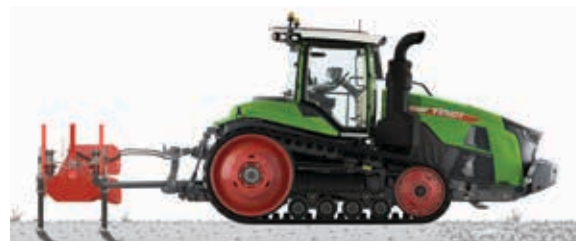
Figure 2: The 1100 Vario MT with Smart Ride Plus allows for easy adjustment of the weight distribution. This results in reduced slip, improved ride comfort, and improved overall performance.